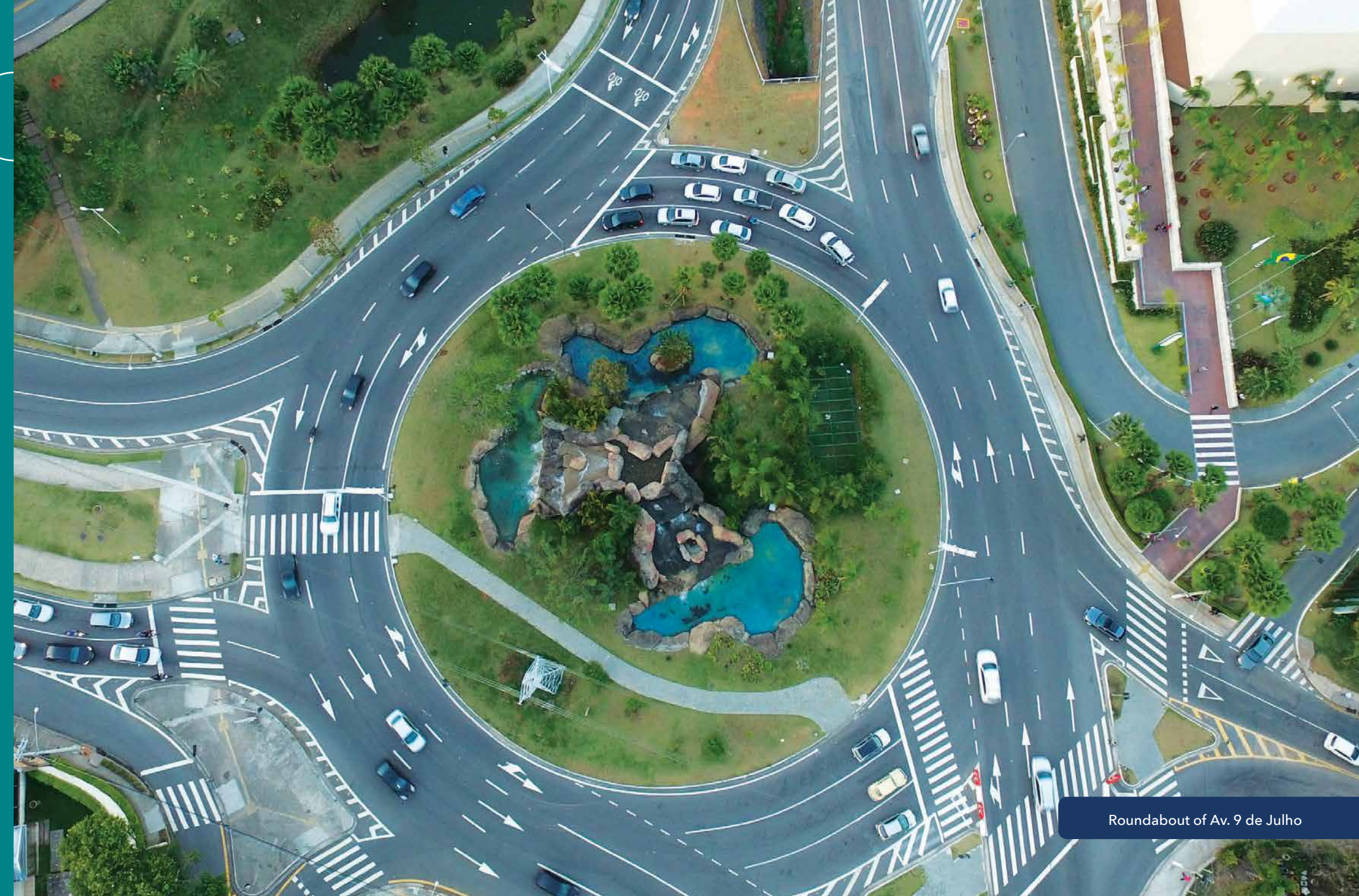
Roundabout of Av. 9 de Julho

POPULATION OF 409,000 INHABITANTS. ABOUT 250,000 ARE BETWEEN 18 AND 65 YEARS OF AGE