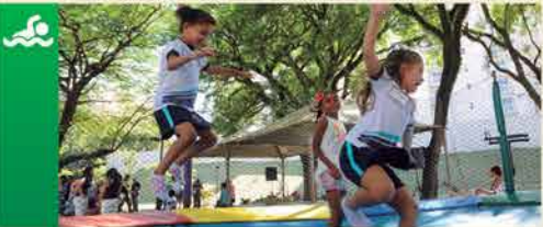
TO INTEGRATE CULTURE, SPORTS AND LEISURE PROGRAMS, AMONG OTHERS

Escola Inovadora (Innovative School) is the major Integrated Education Program of Jundiai. Created by the city hall, it inaugurates a new concept, which promotes modernization of the school environment, new technologies, appreciation of educators and development of projects focused on stimulus to creative learning, Now the students have the opportunity of learning English, from 4 years of age.