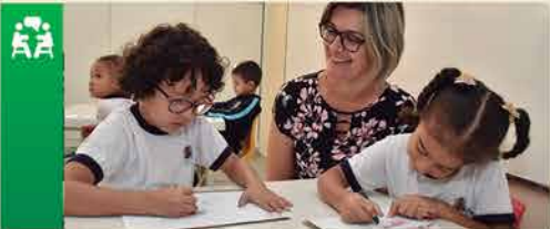
ENGLISH CLASSES FROM 4 YEARS OF AGE