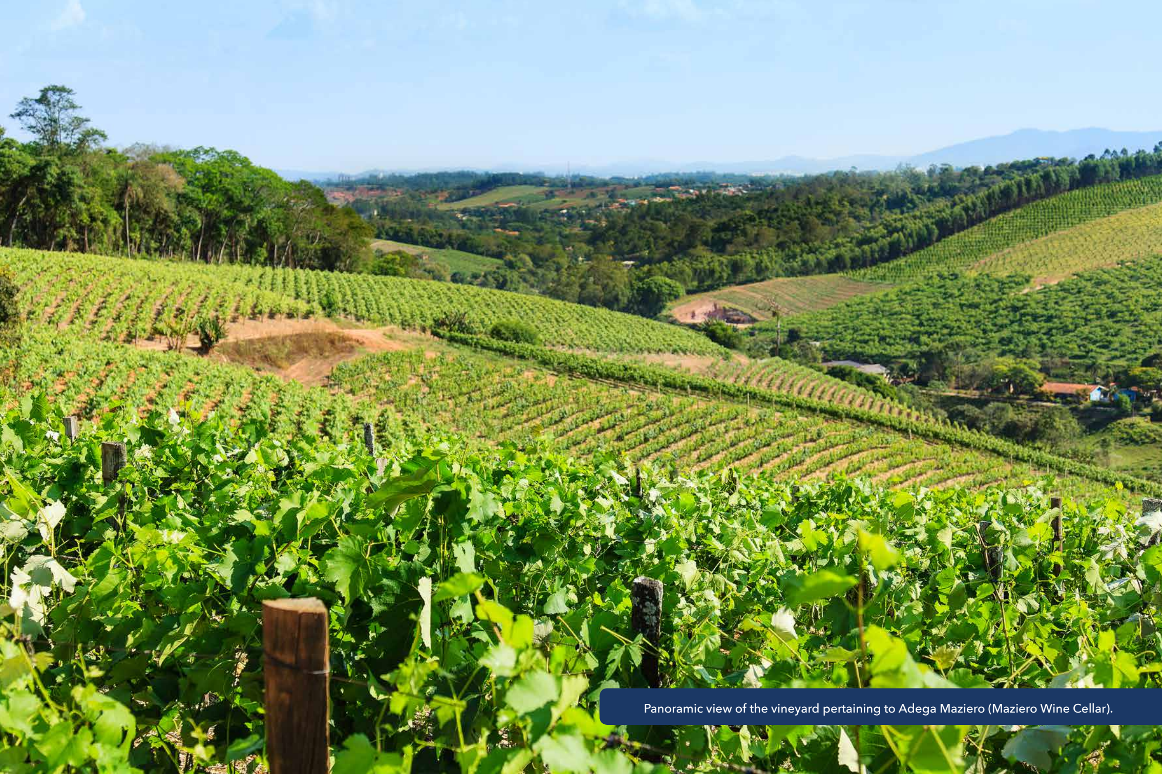
Panoramic view of the vineyard pertaining to Adega Maziero (Maziero Wine Cellar).