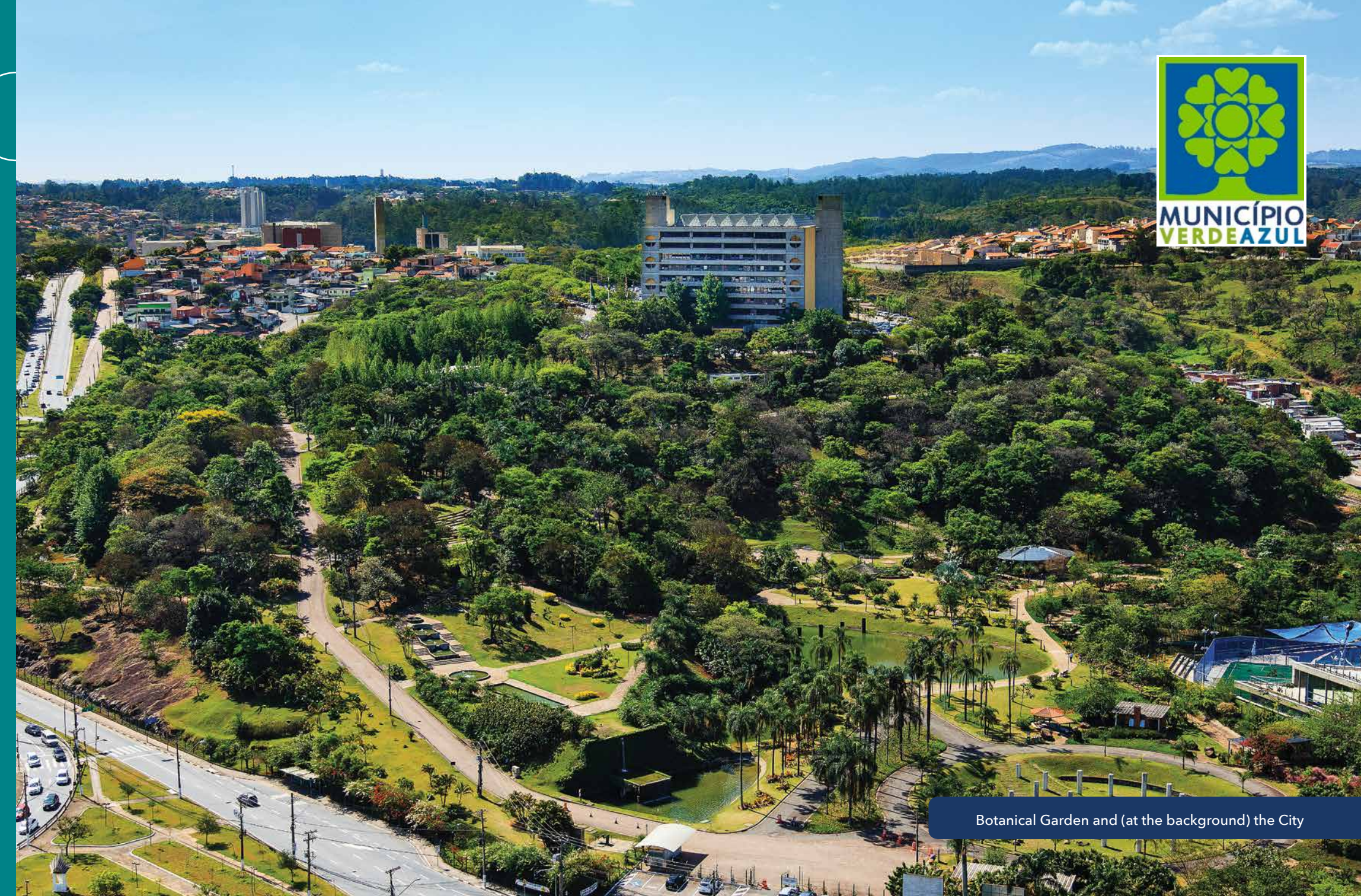
Botanical Garden and (at the background) the City