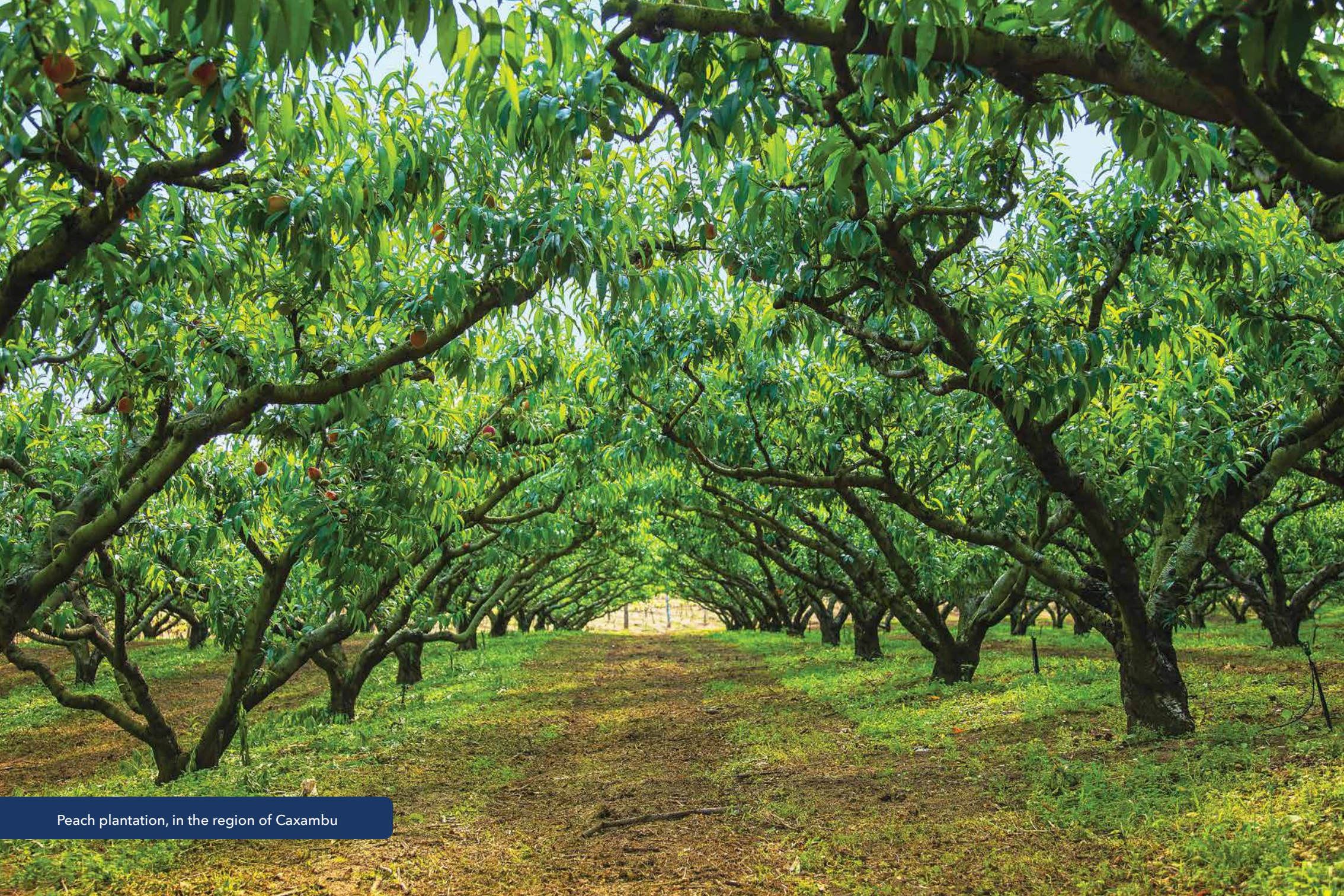
Peach plantation, in the region of Caxambu