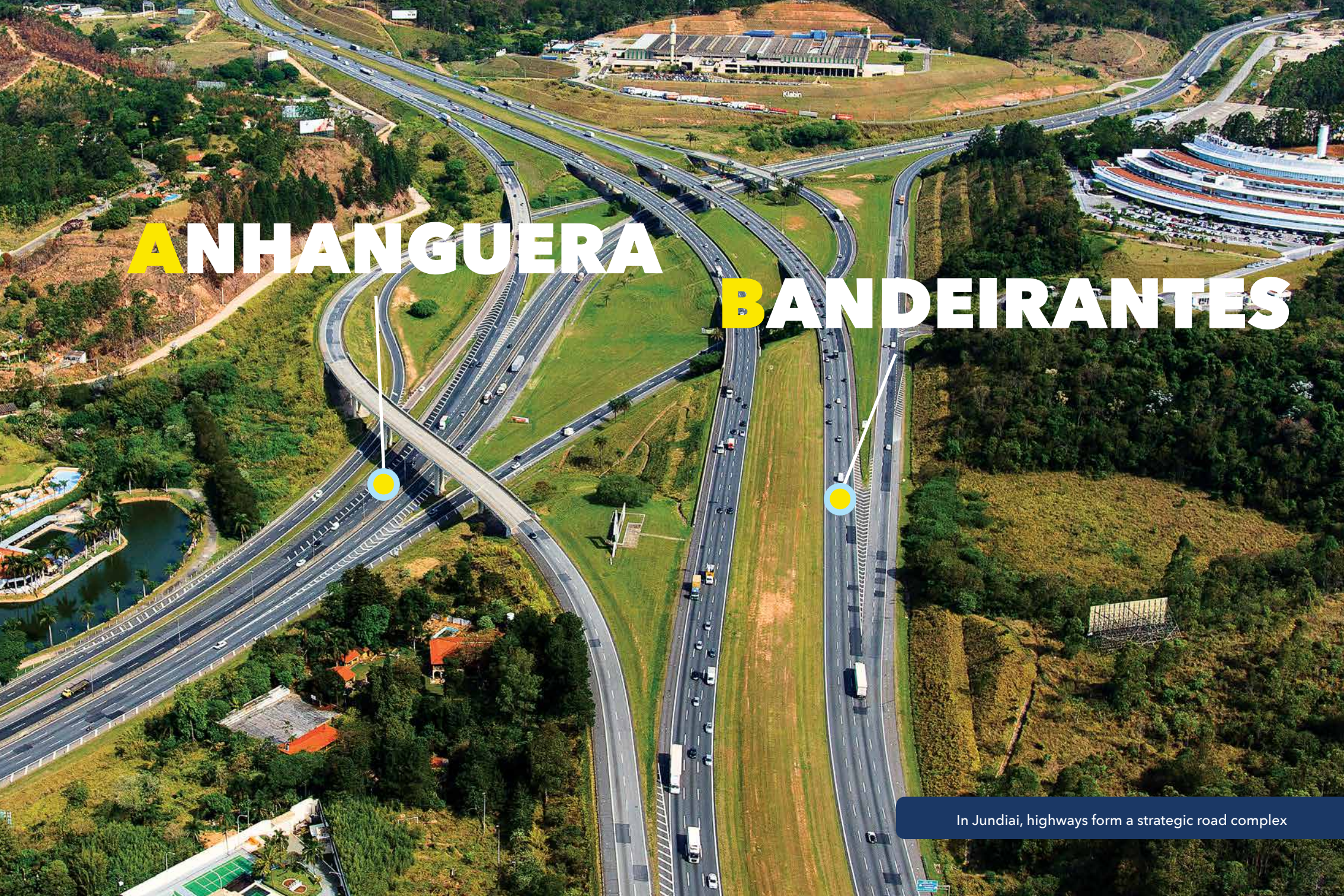
In Jundiai, highways form a strategic road complex